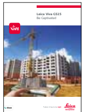
Leica Viva GS15