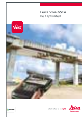
Leica Viva GS14