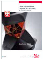
Leica Original Accessories