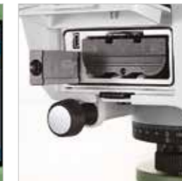
EASY DATA TRANSFER